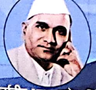
कर्मवीर भाऊसाहेब हिरे